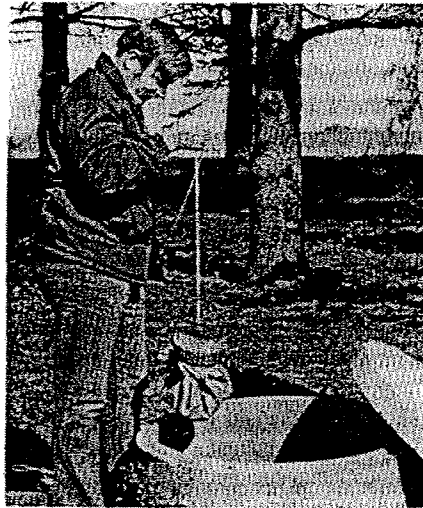
Fig. 3. Strong chlorine solution is recirculated back to the well.