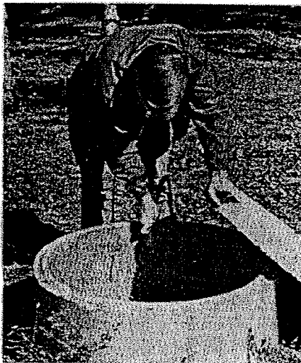
Fig. 2. Weighted sack filled with chlorine powder is lowered into the well.

Newly constructed wells, or those that have been submerged by flood waters, may contain substantial amounts of sediment that cloud the water and interfere with disinfection. Pump the well until the water clears before proceeding with shock chlorination.